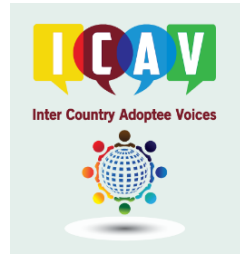
Inter Country Adoptee Voices