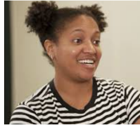
"Adoption: Our Voices, Our Stories"