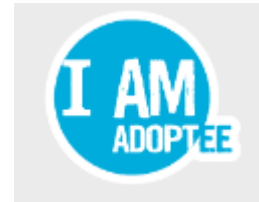
I Am Adoptee - Reflections